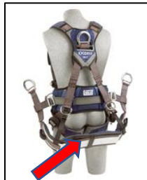
Representative Seat Sling Indicated by Red Arrow

3M Fall Protection has received reports that the aluminum reinforcement plate used in the seat sling on certain DBI-SALA ExoFit™, ExoFit XP™ (inc. Arc Flash), and ExoFit NEX™ (inc. Arc Flash) harnesses can become dislodged from the webbing. In a few instances, the aluminum seat plate has separated from the harness and fallen to the ground, creating a potential dropped object hazard. There have been no reports of injuries or accidents associated with this condition. The performance of the harnesses is unaffected by this issue—they will perform properly in all respects, including as body support for a personal fall arrest system in the event of a fall, even without the added comfort offered by the seat sling.